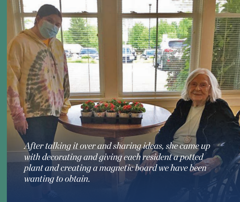
After talking it over and sharing ideas, she came up with decorating and giving each resident a potted plant and creating a magnetic board we have been wanting to obtain.